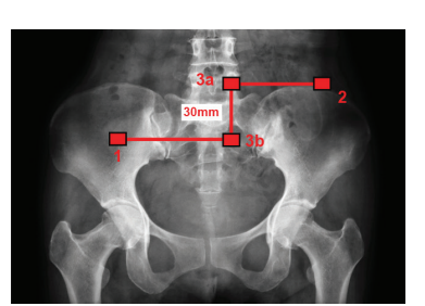
Measurement from Horizontal