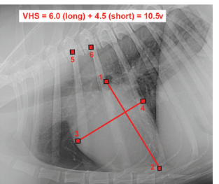
Vertebral Heart Score